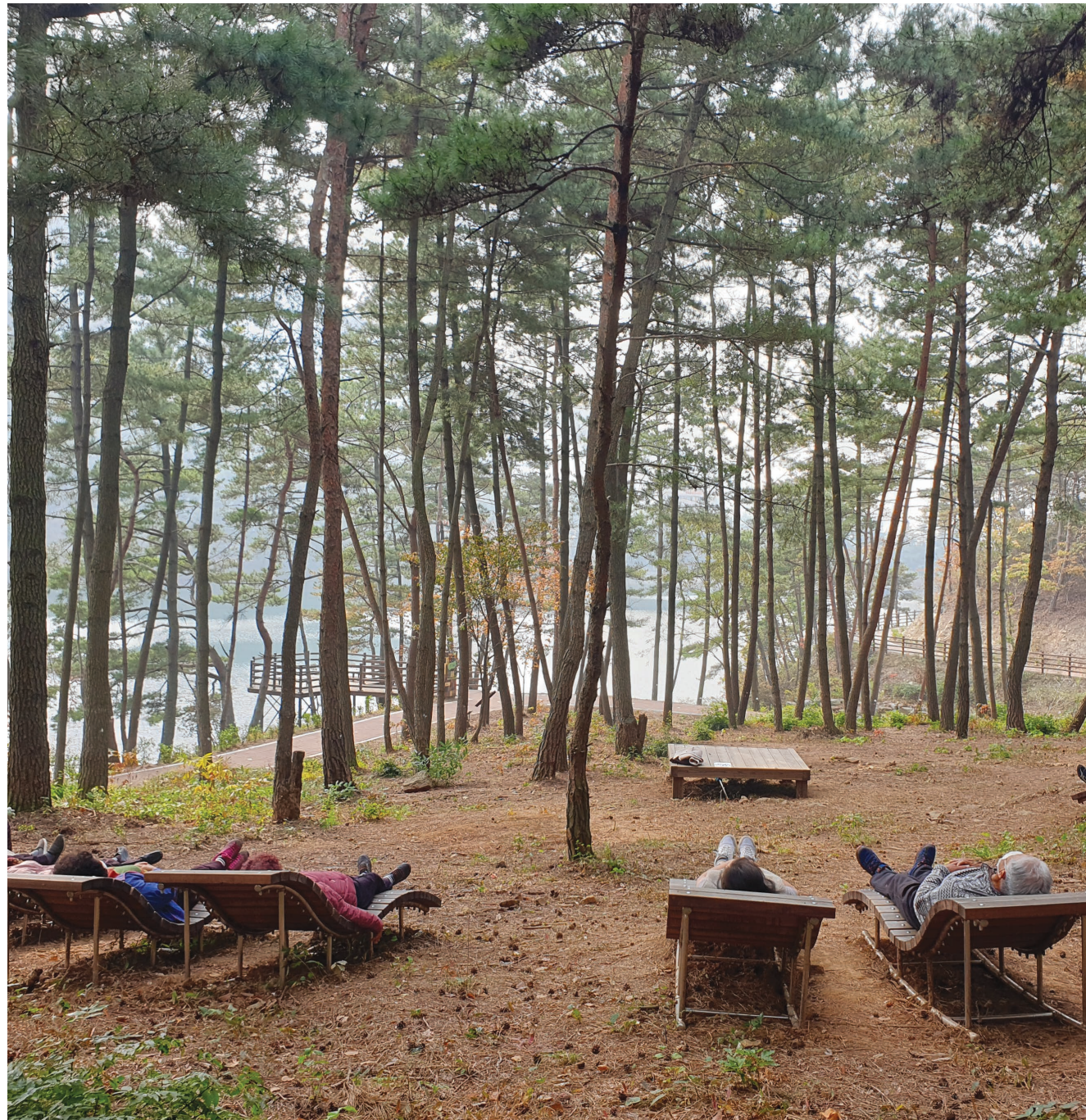
Seocheon Healing Forest

A venue for healing within the forest while maintaining social distancing