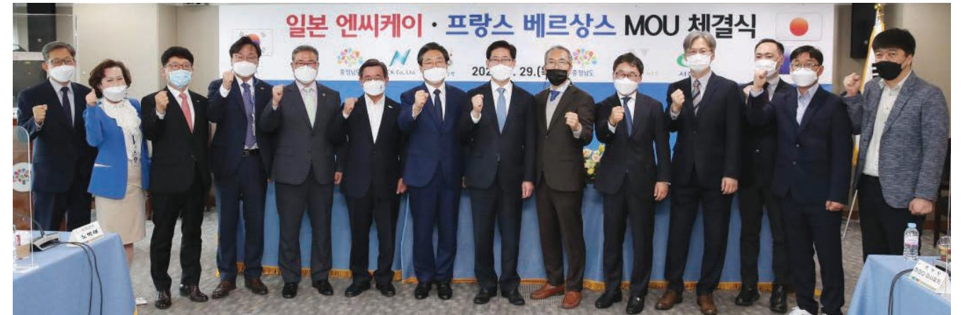
Foreign-invested Company Agreement (MOU) Signing Ceremony

Additionally, Verescence is a subsidiary of Amorepacific Corporation established in 2007, which settled at Chungcheongnam-do Province and took over the management rights of Pacific Glass that produces glass bottles for cosmetics and perfumes. Foreign direct investment to Verescence adds up to USD 40 million.