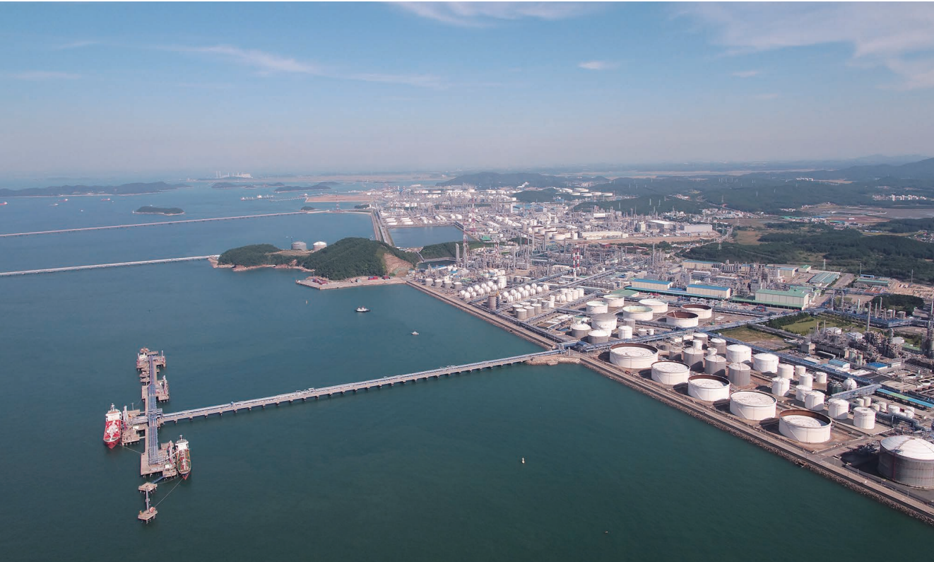
Bird's eye view of Daesan Complex