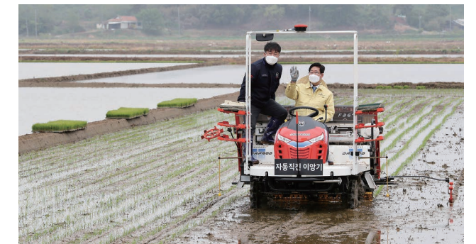
Demonstrate an early maturing rice transplant using automatic transplanter

An official from the Chungcheongnam-do Agricultural Research & Extension Service explained, "Drone direct seeding will reduce production cost down to KRW 1.2 million for every 10,000 m 2 and reduce labor time up to 80%."