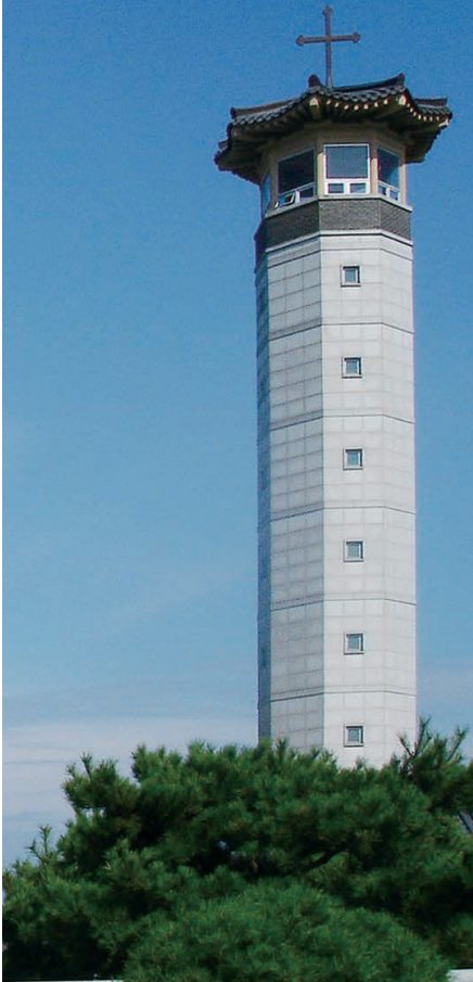
Photo Seosan Haemi Martyrium: The martyrium is also known as "Yeosutgol" where local residents heard the Catholics being executed shouting "Yesu Maria" (Jesus Mary) as "Yeosu" (local dialect for "fox").

On March 1, 2021, the Haemi Martyrium located in Haemi-myeon, Seosan was designated as an international pilgrimage site. The Haemi Martyrium is where Catholics in the Haemi region were executed during the Joseon Dynasty. In this Martyrs' Shrine, there are records of the names (or baptismal names) of 132 Catholics who were martyred. It is also known as the site where more than 2,000 Catholics from the Chungcheong and Gyeonggi regions were executed during the great persecution of 1839 and 1866. The proclamation of the Haemi Martyrium as an international pilgrimage site is notable as it is the 2nd of its kind following Seoul's Catholic Pilgrimage Routes and the 3rd in Asia, not to mention that it is the only single shrine in Korea. International pilgrimage site includes 20 historic locations including Israel (Jerusalem); Italy (Rome); three places in Spain (Santiago); Mexico (Guadalupe), a place where the Virgin Mary was said to have appeared; and Portugal (Fatima), and six locations related to saints.