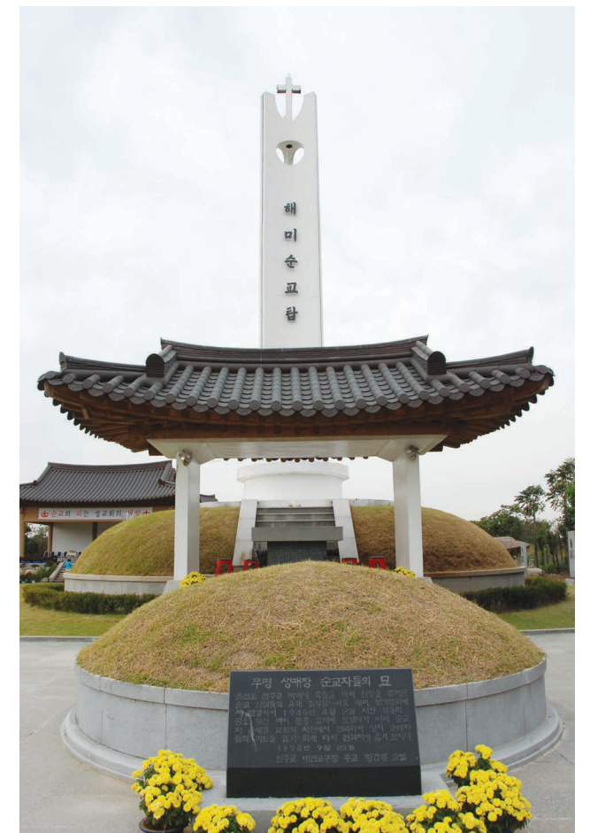
Seosan Haemi Martyrium Tower

Meanwhile, international pilgrimage sites include 20 historic locations such as Israel (Jerusalem); Italy (Rome); three places in Spain (Santiago); Mexico (Guadalupe), a place where the Virgin Mary was said to have appeared; and Portugal (Fatima), and six locations related to saints.