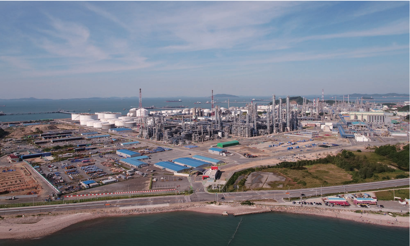
View of Daesan Hydrogen Fuel Cell Power Plant