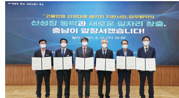
Agreement of Employment Stabilization Preemptive Response Package Support Project