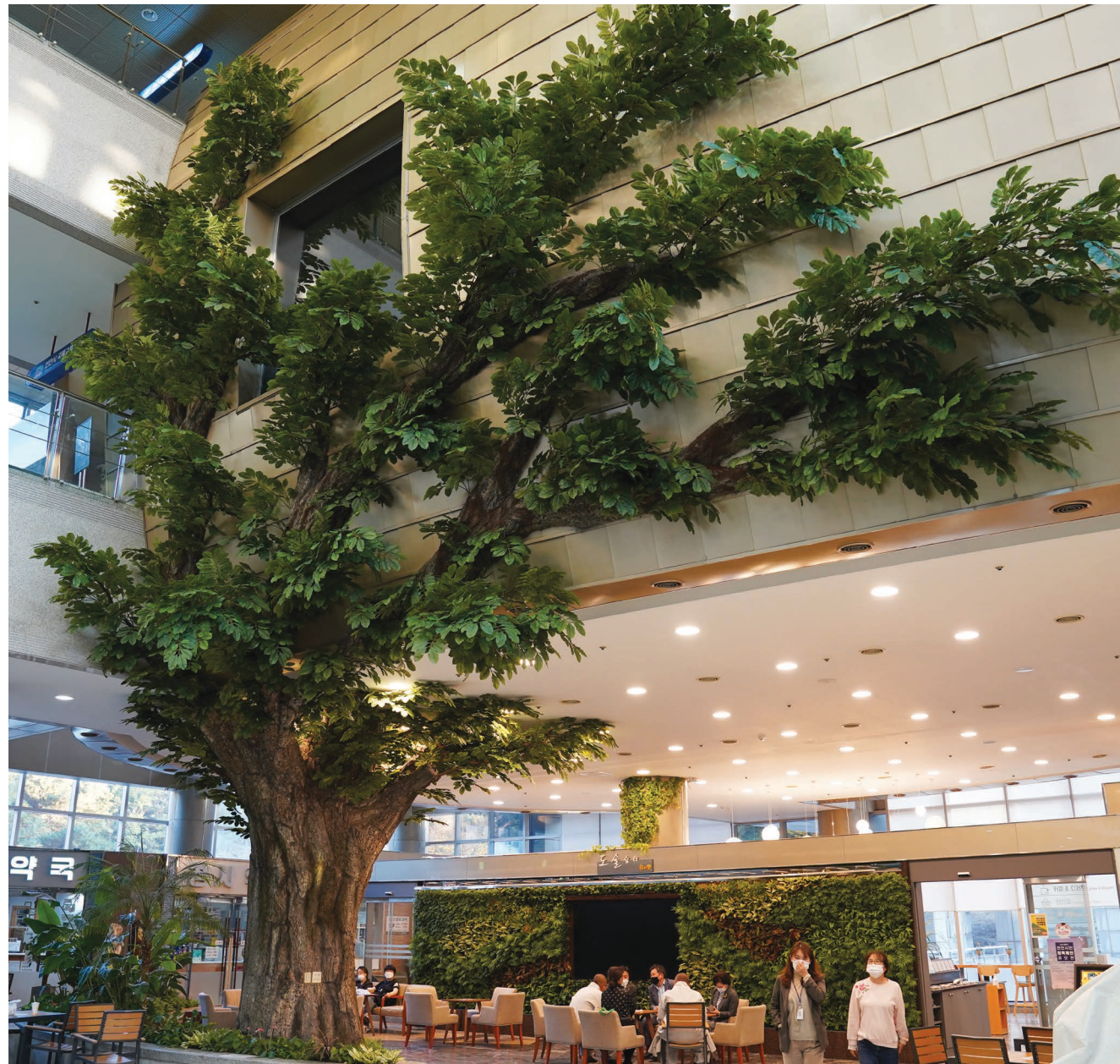
The largest indoor garden in the country, Cheonan

KRW 3.5 billion to be invested this year, carrying out five project areas including close-contact forest