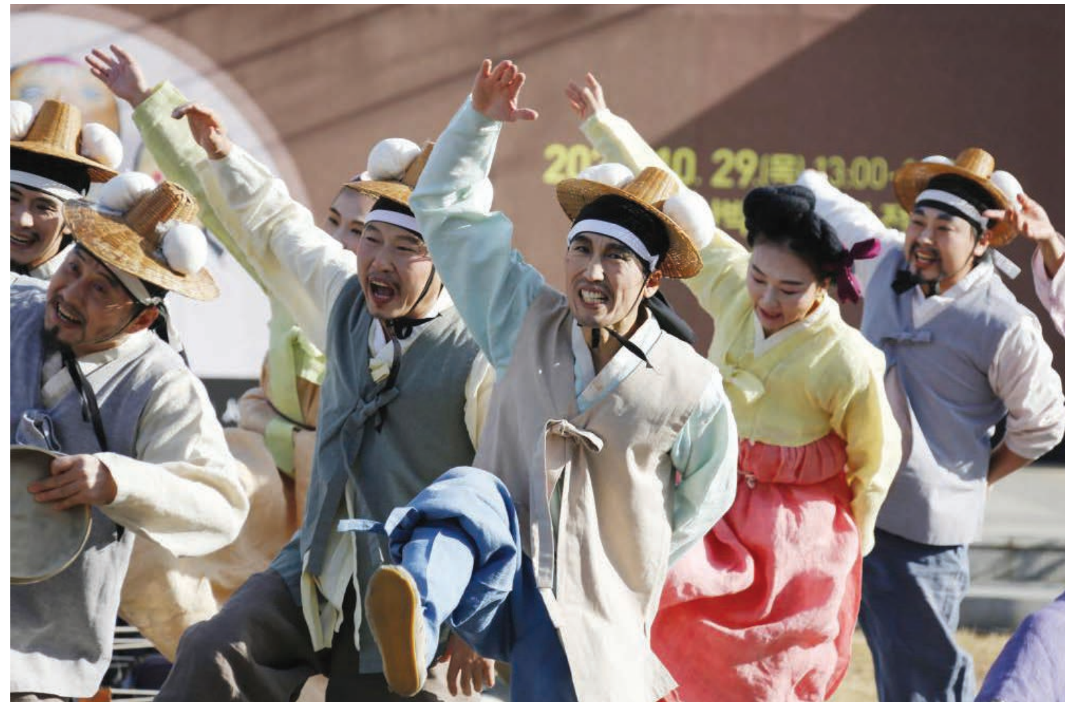
Performance of 2020 Seosan Park Cheomji Nori

"Finding a Future Road for Sustainable Village Cultural Communities Continued for Over 90 Years."