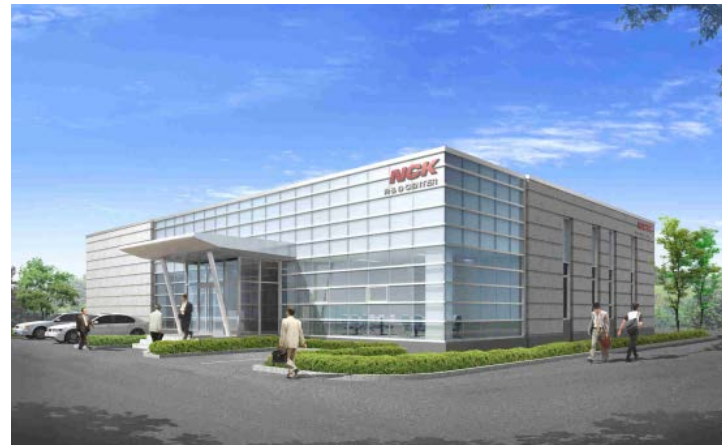
Concept Diagram of NCK

Signed an investment agreement worth USD 77 million with NCK (Japan) and Verescence (France)