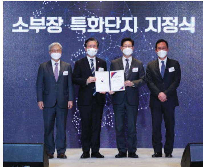
Designation ceremony for specialized complexes for materials, parts, and equipment

No. 1 trade balance in Korea, No. 1 in competitiveness in the display sector.