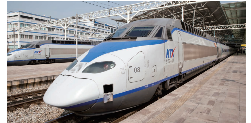
KTX(Korea Train eXpress)

Once the Gyeongbu Express Line and the Seohae Line connects, direct connection with Seoul through KTX is feasible for both the existing Janghang Line and the new Seohae Line. The amount of time it takes from Seoul to Hongseong will be reduced from 2 hours to a mere 45 minutes. Additionally, the time between Boryeong-Seoul is expected to be 1 hour, while Seochon-Seoul will take 1 hour 10 minutes, successfully incorporating the Chungnam west coast region within a one-hour living zone of Seoul. The establishment of KTX Seohae Line reflected in the new