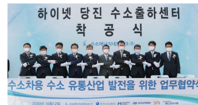
Groundbreaking ceremony for Hinet Dangjin Hydrogen Shipping Center

The province is planning to support the design, manufacturing, certification, and evaluation required for display smart sensor module production by investing