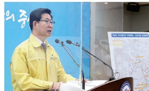
Press Conference of Seohae Line KTX network Construction Project

The MOLIT is planning to reflect the opinions proposed during this public hearing and finalize and notify the results of the "4th National Railway Establishment Plan" within June after deliberation from the Railway Industry Committee.