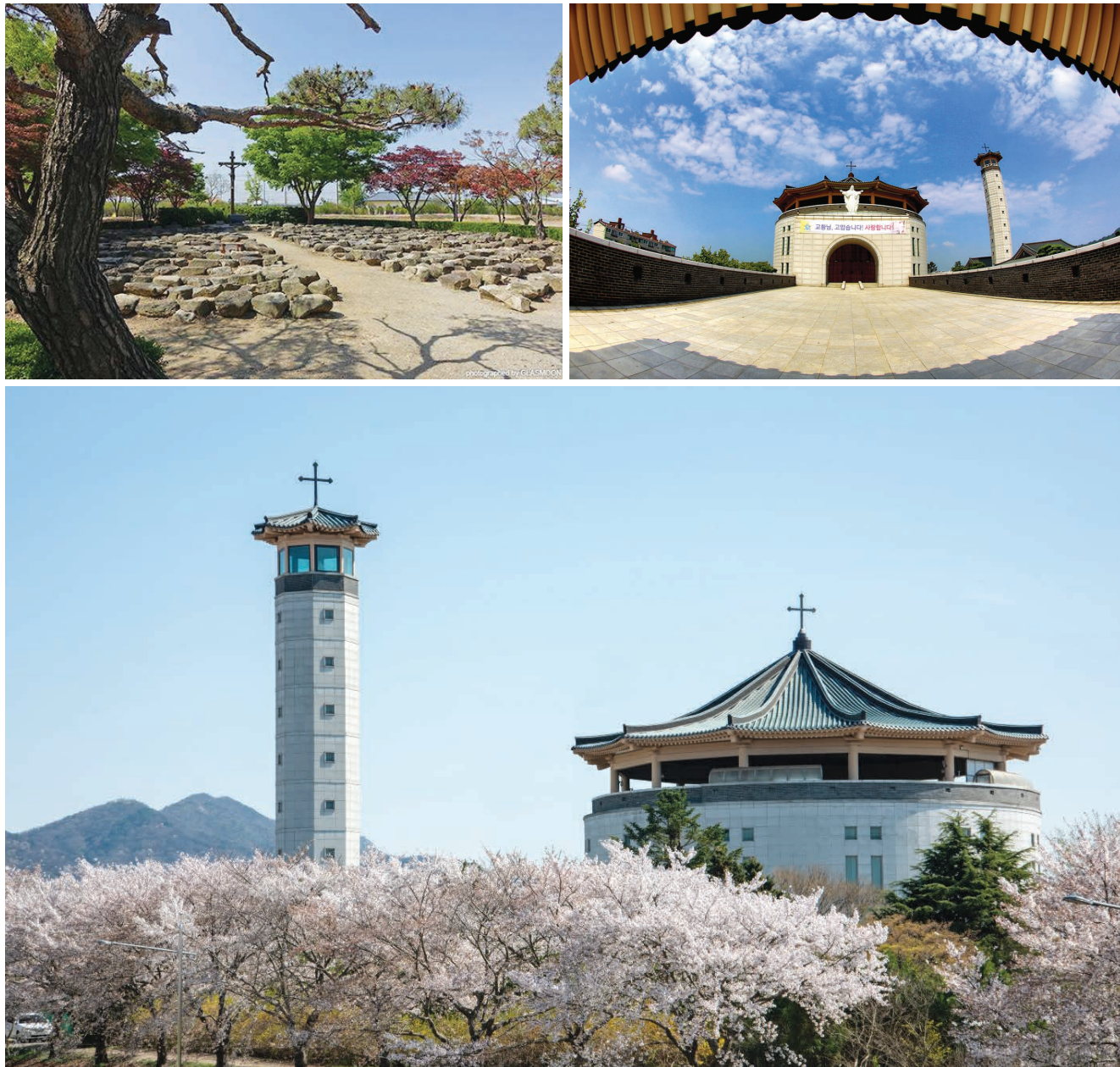
Seosan Haemi Martyrium with Cherry Blossoms

The 2nd of its kind following Seoul's Catholic Pilgrimage Routes and the only single shrine in Korea