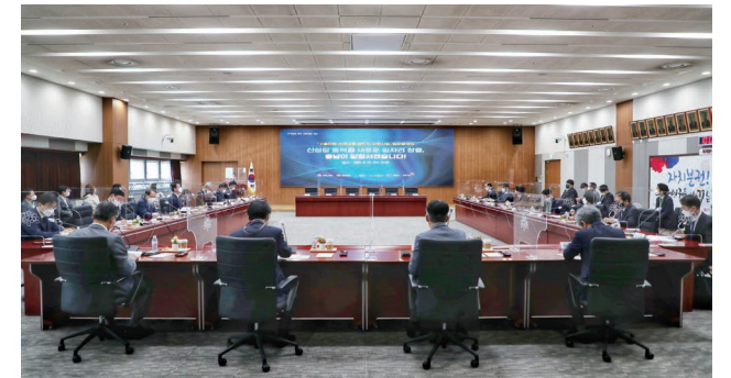
Employment Stabilization Preemptive Response Package Support Project Meeting

Chungcheongnam-do Province will create 5,500 eco-friendly jobs until 2025 by investing KRW 40.9 billion.